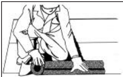
1. APPLY SHINGLE STARTER EDGE